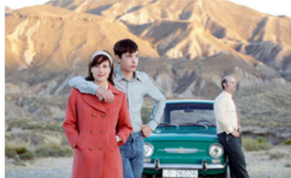
Living Is Easy With Eyes Closed

Two decades ago, the American Cinematheque, in association with the Spanish Ministry of Culture, began importing the best and brightest of Spanish cinema to Hollywood with the film series "Recent Spanish Cinema."